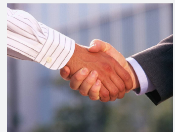
Experience w/All Contract Types