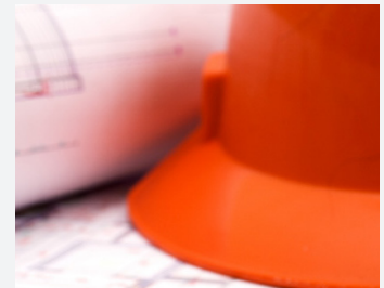
Construction & Management Services

WE EXIST TO IMPROVE THE PERFORMANCE OF YOUR PROCESS AND FACILITY INVESTMENTS.